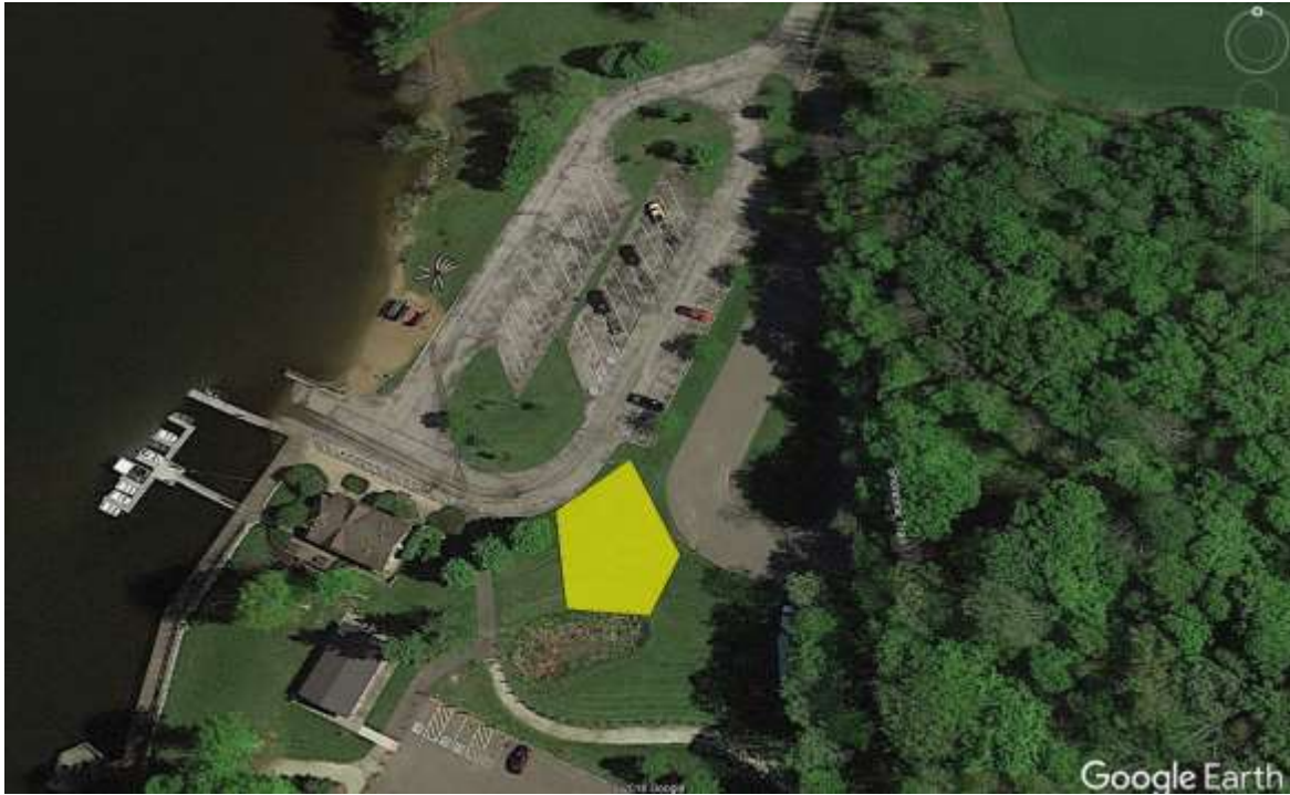
Sippo Lake Park, West