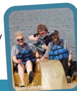
Sippo Lake Park

$10 per adult (ages 12 and up) • $5 per child (ages 2-11) • Under 2 are free ADA accessible. Only available at Sippo Lake Park. First come, first served, and available hourly. Check StarkParks.com for available dates and times.